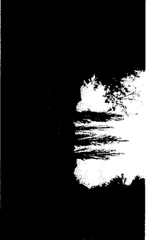
Additional viewpoint 2 (taken Oct 2011): Looking south towards the Green Belt boundary from a point adjacent to the proposed site access road. A field gate will allow glimpsed views of the development from within the Green Belt, although these will be limited to private views from within the pastoral field.