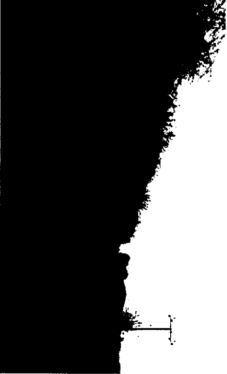
Additional viewpoint 3 (taken Oct 2011): Looking north east along Long Drove at the southern site boundary. The boundary vegetation (around 6 metres in height) will screen the majority of views into the site from the south.